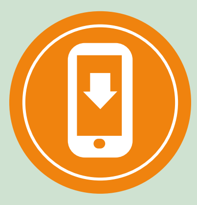
Align / reduce the financial requirements on mobile accounts to increase adoption, especially in rural areas