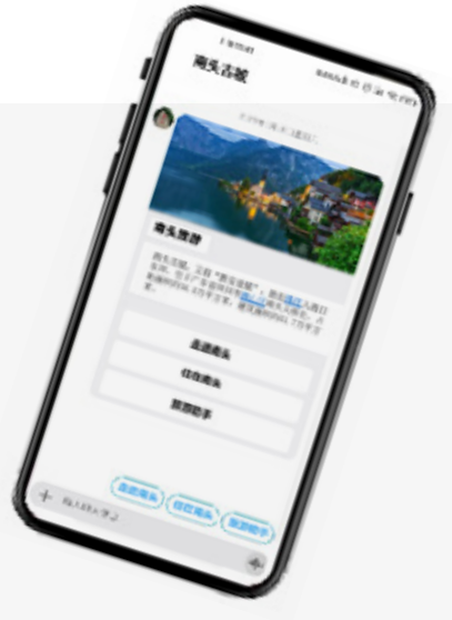
◆ 5G RCS Serving Residents

"5G+" services drive intelligent empowerment for enterprise employees and community residents. In cultural tourism services, auto photo-taking booths (real-time 5G message pushing), virtual commentary, humanistic propaganda screens, and 3D guide services are provided. In government affair services, active 5G pushing allows the public to access the services anywhere anytime. As long as there is 5G network, residents can open their RCS app to get the inquiry, consultation, reservation, and queuing services offered by the government's public accounts and mini programs, instead of downloading, following, registering, and logging in. Without leaving home, residents can reach out to more than 500 government services.