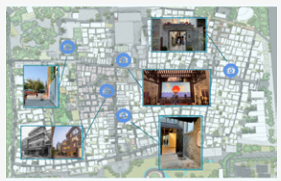
↑ 5G + Vlog Serving Residents

The "tourist + scenery" star-style 5G + Vlog can be a cultural carrier to better expose the scenic spots by stimulating tourists to share the fun. Customized high frame rate cameras can automatically capture touring clips. With such algorithms as beauty, background defocusing, and automatic exposing and focusing, the camera can generate exclusive travel logs to record the amazing moments for each tourist. Suitable for recording different scenes, the customized camera allows animal recognition, delayed photography, night photography, and wideangle photography. It can automatically select clips and generate a collection of the best moments for each tourist and the attraction every day. The edge all-inone machine locally pulls video streams. Supported by customized recognition algorithms and theme templates of the scenic spot, the camera can rapidly edit multi-shot video streams, which can be received and downloaded by tourists through 5G RCS.