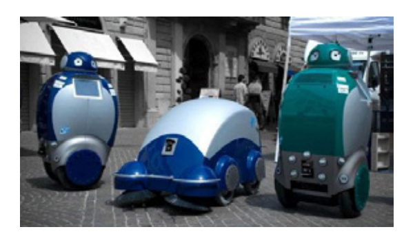
♠ 5G Intelligent Service Robot Serving Residents

5G intelligent service robot features voice interaction, conversation for Q&A, face recognition, semantic understanding, environment perception, and autonomous positioning & navigation. The LED screen on the robot can spread the knowledge of history, epidemic prevention, and garbage classification in all areas. When deployed in scenic spots, the robot with a guide function can interact with visitors to introduce the attractions and recommend routes. Pedestrians can throw garbage in the trash can brought by the robot to keep the city clean and tidy.