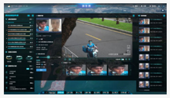
▲ 5G in Intelligent Traffic Management

Traffic management involves various complex scenarios. Easy-to-deploy and convenient 5G cameras, together with AI and big data, create a new mode of intelligent traffic management. 5G cameras can be deployed anywhere, both in ordinary locations and restricted areas such as protected historic sites and ancient buildings. They feature easy deployment, convenient usage, and low deployment cost. 5G's high transmission rate, massive bandwidth, and reliability allow the cameras to capture massive high-definition data, which are turned into intelligent traffic information after AI and big data analysis and processing. The information can help in traffic management plan optimization, management policy development, carbon emission reduction, and determination of traffic safety technology and management methods through accident cause analysis.