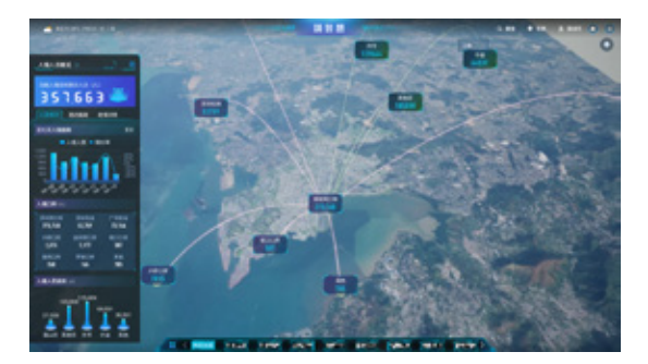
↑ 5G in Digital Epidemic Prevention and Control

The Smart Nanshan in Shenzhen project enables COVID-19 epidemic prevention and control in Nanshan entirely digital. 5G network and terminals play a critical role in dynamic data aggregation, data mining and analysis, expert video conferencing, and on-site real-time linkage thanks to fast deployment, high bandwidth, and low latency. The platform can independently and intelligently collect basic information and health status of personnel returning to work online, which helps the government approve enterprises' production resumption application. Citizens' travel trajectories in the past 14 days are automatically tracked to identify any possible source of infection through big data analysis. 5G cameras and NB-IoT locators are deployed in key epidemic prevention and control areas for epidemic monitoring. Al robots can automatically make calls to investigate persons and collect information. Technologies like AI, big data, and 5G are integrated to accelerate virus detection and diagnosis, monitoring and analysis, and full traceability management.