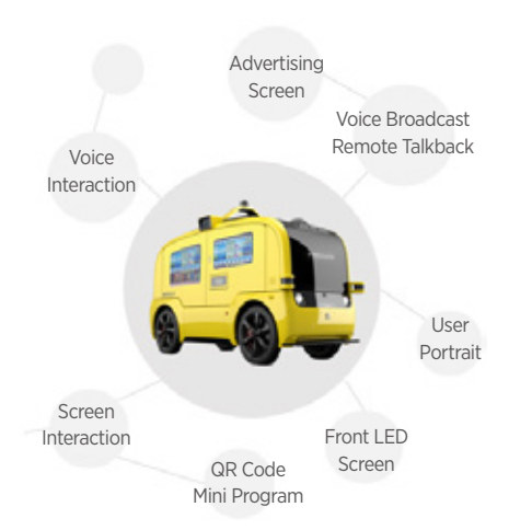
♠ 5G Intelligent Unmanned Vehicle Serving Residents

Built on L4-class autonomous vehicles and stable, low-latency, and fast 5G network, "5G Smart Unmanned Vehicles" offer a smart service platform on the wheels. It can provide residents and tourists with free meals, first-aid medicine, masks, alcohol, and anti-mosquito medicine. The unmanned vehicle can run 24 hours a day. Residents can beckon the vehicle and scan the code to get the needed services. The vehicle can also be used as a mobile propaganda station for epidemic prevention and extreme weather notification. At the same time, it can act as a video collector to connect tourists, vehicles, roads, traffic data in real time, therefore providing effective data for urban governance.