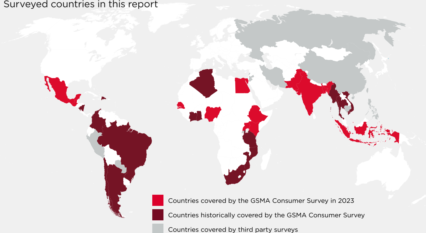
Figure 1 Surveyed countries in this report

up to 75% of the adult population in LMICs. (See Table 2 for a comprehensive list of countries covered by the annual GSMA Consumer Survey). The survey is representative of the entire adult population 5 of these countries, including both mobile users and non-mobile users.