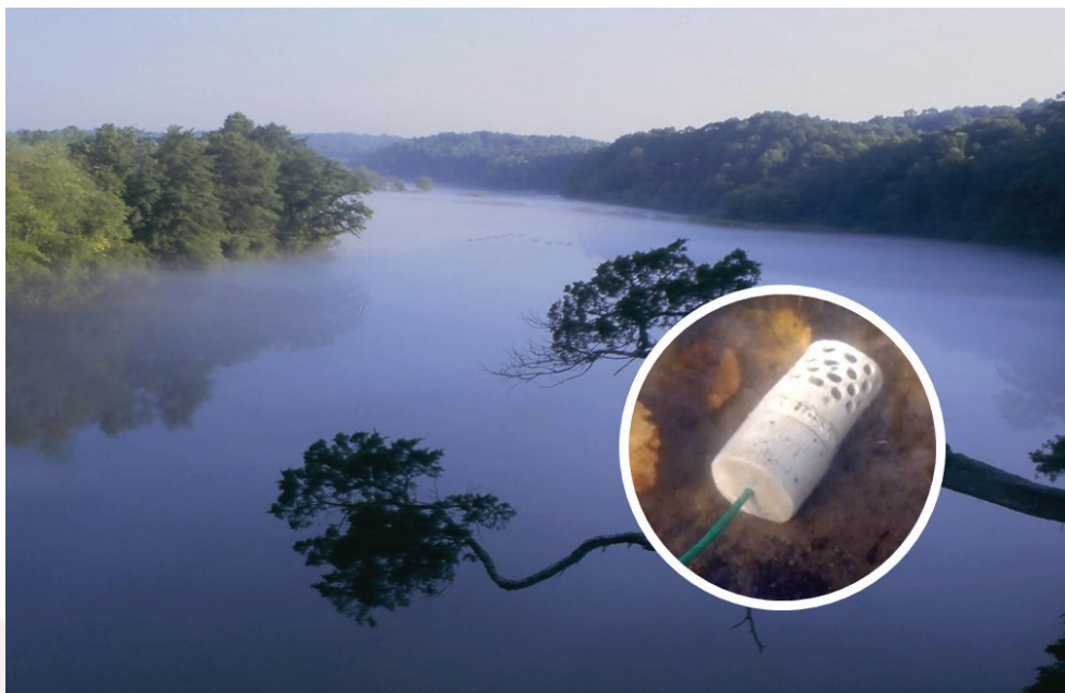
The Chattahoochee River, inset with the new connected water sensor

The innovative devices could enable local stakeholders to cost-effectively remotely monitor the temperature, the conductivity and the turbidity along the entire 430 miles of the river.