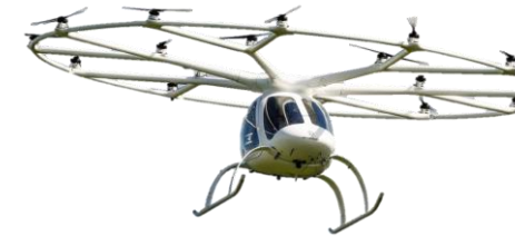
Urban Air Mobility